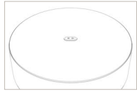
LOCATION FOR 30", 36" & 42" ROUND/OVAL TABLES